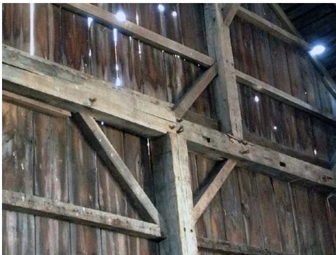
The barn has holes in the roof and walls, and wooden pegs are coming out of their holes.

Of particular concern is the north side of the barn, because the wall’s braces have become disconnected from the horizontal timbers. The wall is pushing outward, leading to fears that the barn could come down on its own with the help of a strong wind.