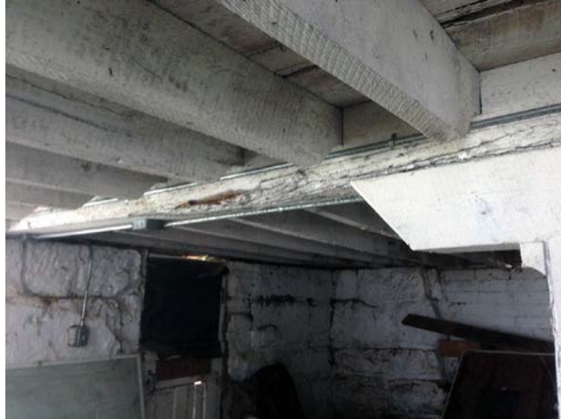
The stones and timbers of the foundation are in better condition than the rest of the barn.