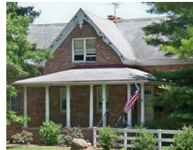
Rebuilt Fitch-Atkinson house today at 7555 Columbia Rd.