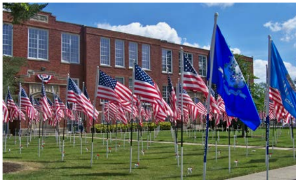
Ohio Flags of Honor display stood at Olmsted Falls City Hall July 3-5.

Residents get their second opportunity in six weeks to celebrate Olmsted Falls and Olmsted Township with the 23 rd annual Olmsted Heritage Days from August 14 through 17. Most events occur around Grand Pacific Junction, but the festival is for all of Olmsted. The first event, the Citywide Garage Sale, actually occurs in garages, driveways and lawns all around the city and the township. It is scheduled to run from 9:00 a.m. to 3:00 p.m. on both Thursday, August 14, and Friday, August 15. Maps of participating locations will be available at Grand Pacific Junction merchants and elsewhere.