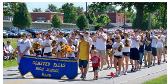
The Cornerstone Festival parade went from Mapleway Drive to the middle school.