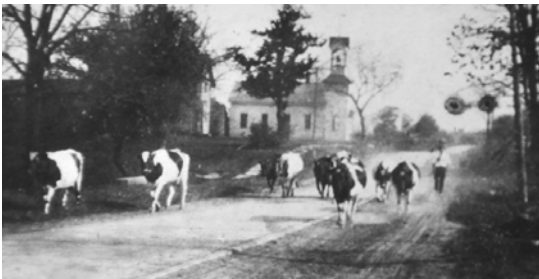
Columbia Road (then Columbia Street) was a quiet country lane in West View’s old days. The Wesleyan Methodist Church can be seen in the center. The building still stands.

An 1874 map, which listed 14 merchants in Olmsted Falls, listed just one in West View: