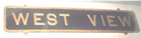
A sign from the old West View depot hangs inside the Olmsted Falls depot.

Despite having the first railroad in Olmsted, West View did not develop much until the 1870s, when sandstone quarries were established in the area. The quarries were in both townships, but other businesses chose the Olmsted side for their stores.