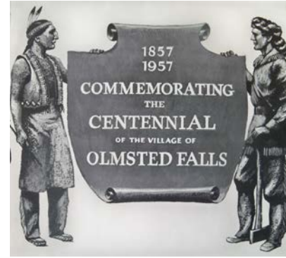
This artwork for the Olmsted Falls centennial was a year late. Plus, Native Americans were long gone by the 1850s.

Another occasion when Olmsted residents made a questionable choice in celebrating their history occurred almost six decades ago. However, instead of celebrating a year early, they celebrated a year late. The occasion was the centennial of the incorporation of Olmsted Falls as a village. The incorporation became official on April 7, 1856, so the year for the centennial celebration should have been 1956. Maybe Olmsted residents weren't paying attention to their history then, because the celebration didn't occur until 1957.