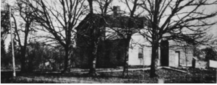
The Hoadley house had a view to the west.

story is that, when the Hoadleys looked out of the window at the front of their house, their view was to the west. Thus, they had a “west view.”