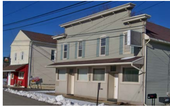
West View’s small business district included this Italianate-style building, which still stands along the section of Columbia Road near the underpass for the railroad.

An 1874 map, which listed 14 merchants in Olmsted Falls, listed just one in West View: