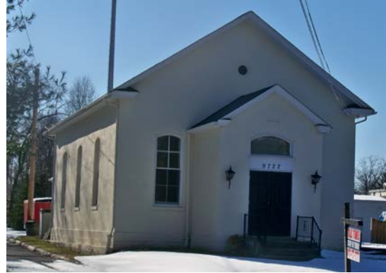
Built in 1880 as a two-story school, later remodeled with just one story, this building at 9722 Columbia Road became West View's town hall.

West View continued as a quiet little village for a few decades. Then, in the late 1960s, there was a flurry of efforts by neighboring communities, including North Olmsted, Olmsted Falls and Berea, to annex all or parts of Olmsted Township. West View got involved and seemed to be a leading contender until the county commissioners decided in July 1969 that they didn't want to have a newly expanded West View that would surround Olmsted Falls.