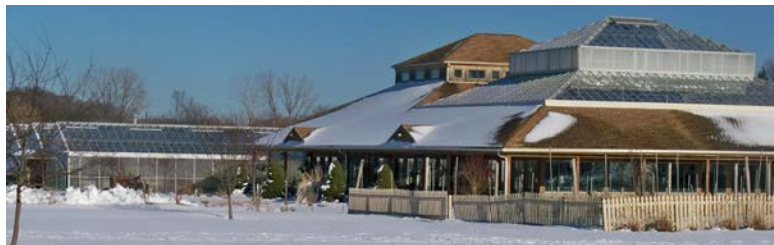
Although it is not evident in this view, the former Westview Greenhouse became part of Schuster's Westview Gardens.