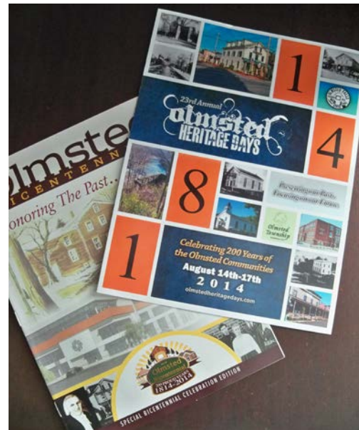
These were two of the publications that marked the early bicentennial observance in 2014.