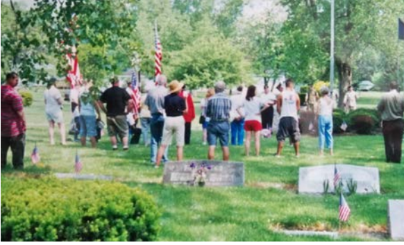
The New Chestnut Grove Cemetery was previously the site of a greenhouse along Lewis Road. This photo is from a Memorial Day 2006 ceremony.

restaurants. And finally, (but the most fun of all) was the ‘BIG POND.’ It sits [way] up on a ridge behind what is now the cemetery... We swam there and often times had ‘parties’ there. Most of my friends can still recall my Dad chasing them off the property with a gun when they were caught there drinking and smoking pot, (and skinny dipping).”