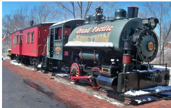
The 1922 Vulcan locomotive and caboose are a popular attraction at Grand Pacific Junction.

caboose next to it. He consulted with four paint companies on the colors for the buildings but rejected their ideas and chose the colors himself. As the years went on, he bought more buildings in the neighborhood and even built new structures to complement the old ones.