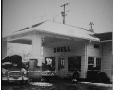
This building was Schady's Shell station for three decades.