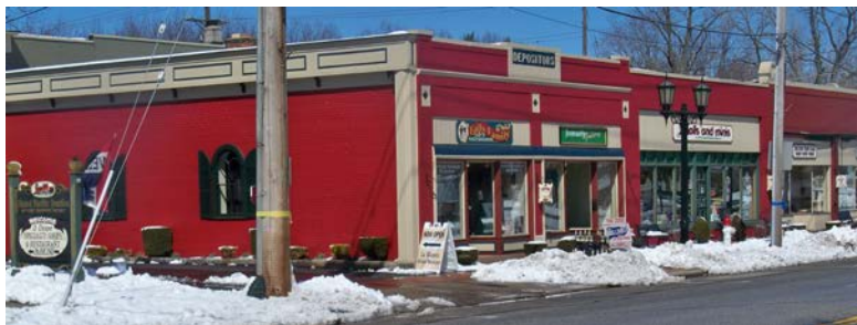
The Depositors Building, built in 1924, went through extensive renovations to become part of Grand Pacific Junction.