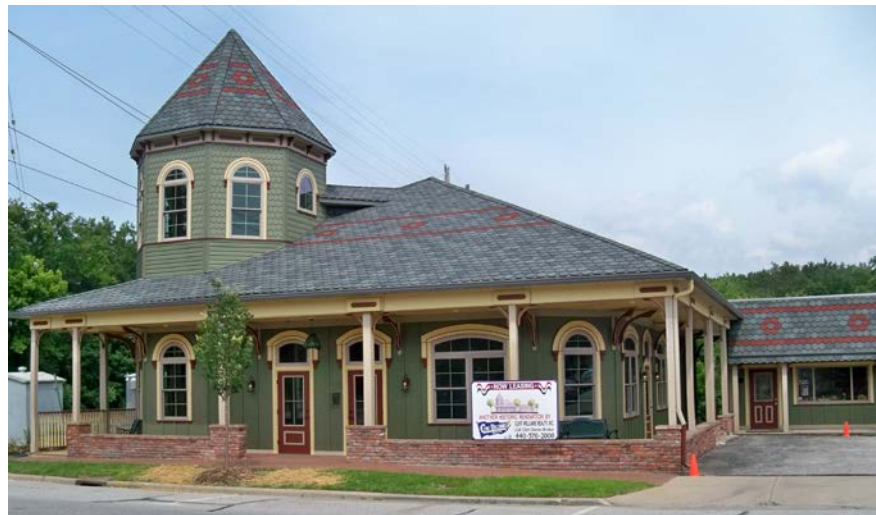
It looks like a railroad station from the late 1800s, but this is really a new store taking its place among older neighbors at Grand Pacific Junction.