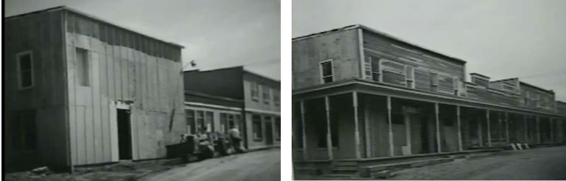
This pair of photos shows the western end of the boardwalk side of the Depositors Building during the renovation process. The first was taken before the boardwalk itself was built.

And now, it’s a “bomb shelter” that protects Matteo’s wine.