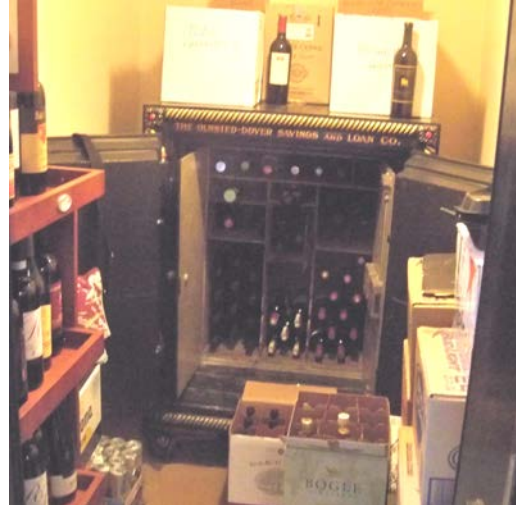
Olmsted-Dover’s safe now holds wine.