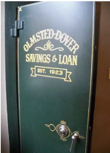
This safe remains in what now is Matteo's Italian Restaurant.

This is the sixth in a series of articles about Grand Pacific Junction. If you missed the beginning of the series, go back to Issue 21 of Olmsted 200, which came out on February 1, and read each issue since then.