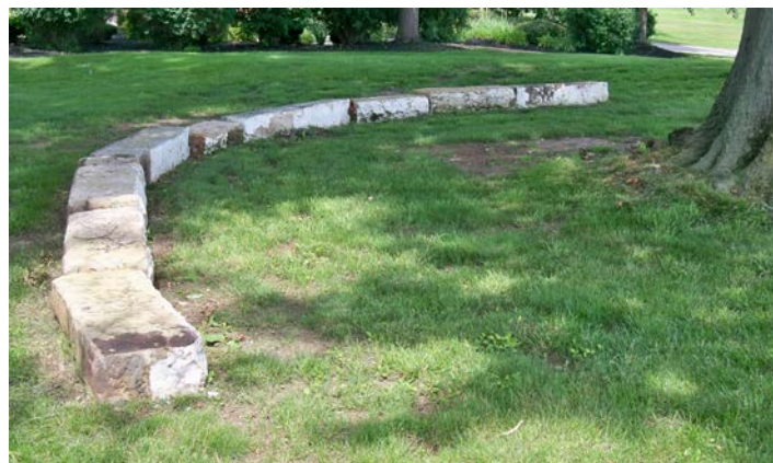
Several stones were put into a partial circle near a tree next to the barn’s foundation.

Some of the barn’s wooden beams also remain on the site. A few of them show the thick iron nails that Hall used to fasten them to other beams.