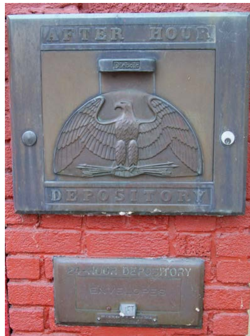
National City Bank’s night deposit box remains on the front of the building.