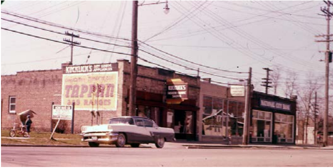
Kucklick’s had the south end and National City Bank had in north end in this 1958-59 photo.

boardwalk.’ I wanted to keep it in a sense the Wild West theme, something that would be out of the past, so to speak. So we came up with the different roof lines and added a second story. Then we did a porch over the whole thing.”