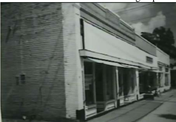
This is how the building looked before renovation.

“You’ll think I was smoking dope when I rented this building,” he said, as he sorted through his photos of the building still in the process of being repaired and refurbished in the early 1990s. “The windows were all boarded up. That’s the building I rented. Can you believe how stupid I had to be? This driveway out here was nothing but a dirt road. I did business for four months and those windows were boarded up.”