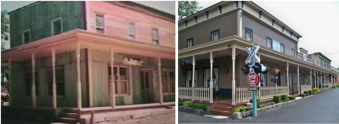
The left photo, courtesy of Clint Williams, shows the end of the Depositors Building as it neared completion of the renovation process. The right photo shows how that section looks in 2015.

In addition to Matteo’s, the merchants now operating in the Depositors Building include the Music Box and Dolls and Minis on the Columbia Road side and Depot Barber Shop, Pink Bicycle Boutique and La Blanca Bridal Boutique on the boardwalk side.