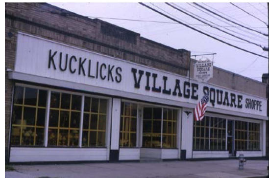
Kucklick’s looked like this in 1964.