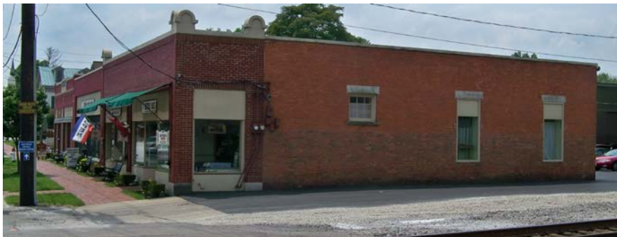
This is how the northern end of the Depositors Building looks in 2015.