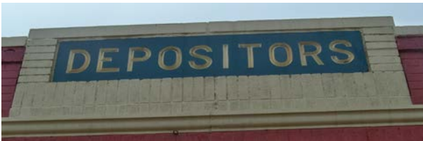
The Depositors name recalls its banking years.

For many years, a branch of National City Bank occupied the northern end of the building closest to the railroad tracks. Later, Cunningham’s Nationwide Insurance Agency and a miniature shop were located in the building.