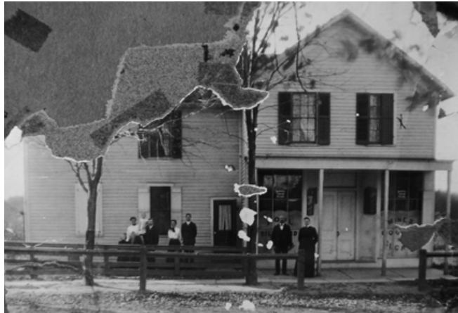
This is what the building looked like as a pool hall and saloon run by Herman Fenderbosch.

“The Master Cleaners’ floor was all falling out,” he said. “We had to take the whole floor out, put a new floor joist and everything in there, put a new heating system in, air conditioning, all new. That was just standard with every building.”