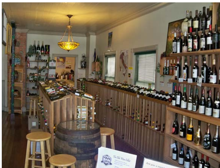
The former saloon is still in the alcohol business as the Olde Wine Cellar, part of Grand Pacific Junction.