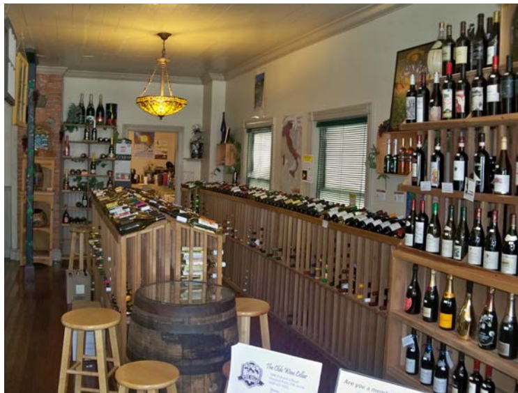
The former saloon is still in the alcohol business as the Olde Wine Cellar, part of Grand Pacific Junction.