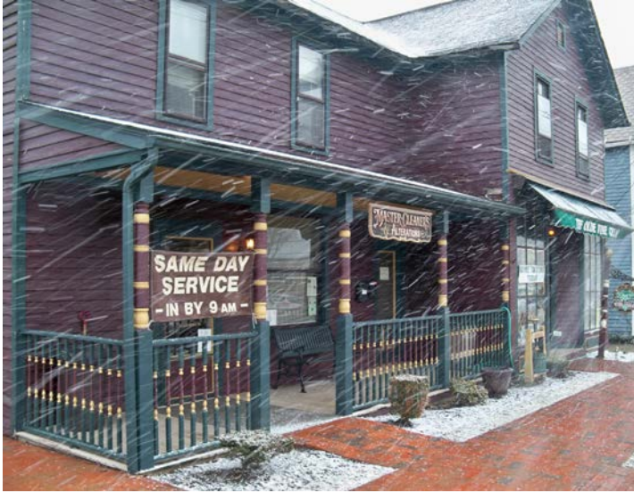
The left side of this building once was the pool hall and the right side was the saloon operated by Herman Fenderbosch in the late 1800s and early 1900s.

was the most prominent of several saloons in and around Olmsted Falls that were the subject of much community and political turmoil when they were in operation.