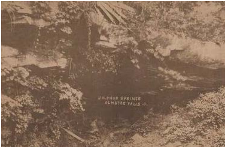
This postcard from 1914 labels the entrance of one cave as "SULPHUR SPRINGS OLMSTED FALLS."

In regard to that last cave, a 1914 postcard seems to show its entrance but offers no other information about it.