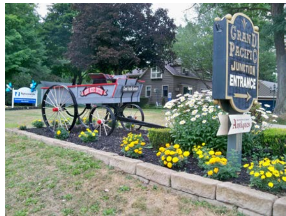
This wagon and sign mark the Orchard Street entrance to the Junction from Bagley Road.