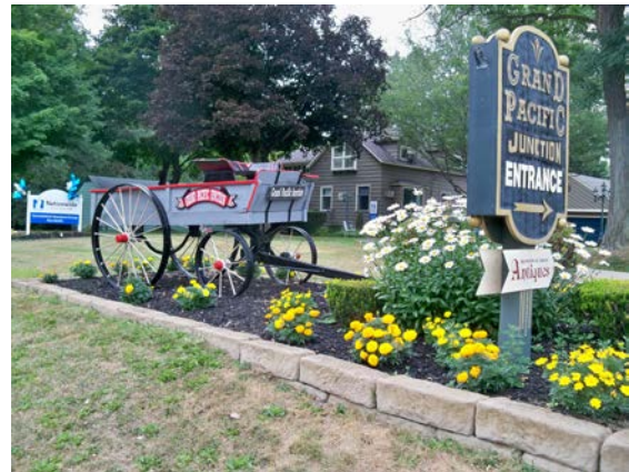
This wagon and sign mark the Orchard Street entrance to the Junction from Bagley Road.