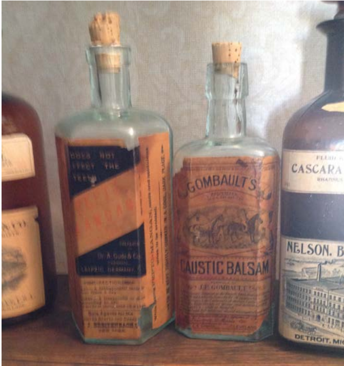
The bottle just right of center in the above photo contained Gombault's Caustic Balsam.