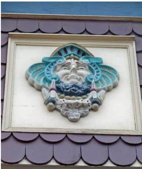
A glance up at the front of the 8020 Columbia Road building reveals this colorful character.

“And that’s quite a coup when you get two insurance companies side by side,” Williams said. “Isn’t that something?”