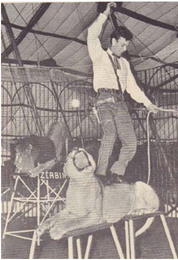
This photo is from a Mills Bros. poster from 1963.