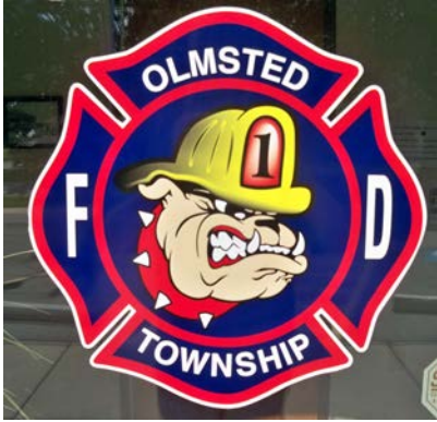
This is the department's logo.