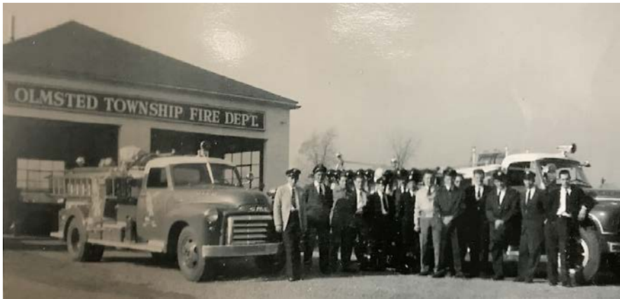
This is another early photo of members of the Olmsted Township Fire Department with their firetrucks outside their original two-bay fire station.