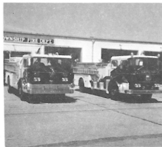
Valek's history includes a photo page of vehicles and facilities. At upper left is the original truck with a tank mounted on a school bus chassis. Lower right photos show fire station additions, as well as vehicles.

In August 1948, the old tanker truck reached the end of its usability. Fortunately, the department had just made $318.19 by operating a stand at the Olmsted Homecoming on August 16. That went most of the way toward the $485 needed to buy a used 1941 GMC cab-over-and-chassis on which they mounted the tank and pump.