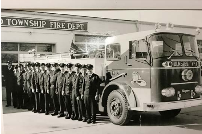
In 1963, the township bought this Seagraves Triple Pumper, the first firetruck approaching the size of those in use today.