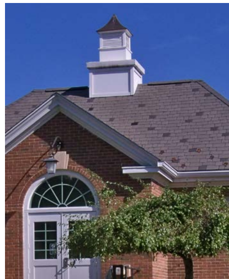
On the left is the artist's drawing of Township Hall from the souvenir program for the Olmsted Homecoming in 1939, the year the facility was built. It shows the original design for the cupola. In 1947, the fire department installed a siren in the cupola and remade its top. On the right is a recent photo of Township Hall showing the current cupola.

“That night the people of the neighborhood had the pleasure of listening to the wailing of a 5 horsepower siren for the first time,” Valek wrote. “Along with a siren for calling those nearby, we started a calling system of four phones in four firemen’s houses. Those firemen in turn called the rest of the firemen. This same system is still being used satisfactorily today by some of our wives who have honored us with their services without pay and very little thanks considering some of the lip service that they have received.”