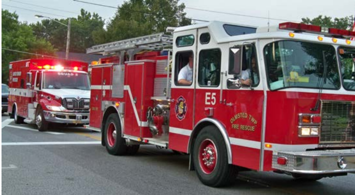
The department now uses trucks like these, seen in a recent Olmsted Heritage Days parade.

However, the plans didn't work out as smoothly expected. The police station was completed, and the department moved into it by the fall of 2005. But by November 2006, construction had halted with the fire station and the service garage only partially built. The fire station was estimated to be only 35 percent complete – essentially just a shell of a 5,000-square-foot, two-story building. The service garage was about at the same stage of completion.