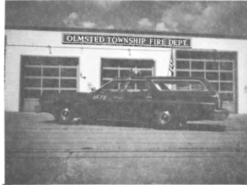
= FIRE APPARATUS =