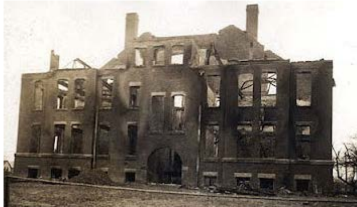
The story of the fire at the Lakeview School in Collinwood might have been mixed up with the story of the orphanage on Gore Orphanage Road near Vermillion.