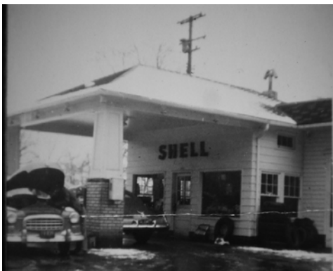
Schady's Shell was a hangout for many Olmsted teens, including those in this story.

As seniors in high school, it was an exciting, wonderful time to be alive after 12 years of restraints of public education. Or so was the stellar wisdom of 17- and 18-year-olds that was apparent and indelibly etched in our idealistic minds. Added to that, the ingredients of an age-old urban legend were quite tantalizing.