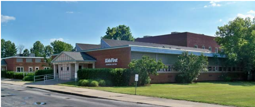
The addition to the school planned in 1948 and the twin wing that later joined it now house a day care facility, so they still serve Olmsted children.

As well as adding seven classrooms to the school, the planned new wing was to provide more lockers and two more restrooms. It was designed to extend west from the corridor that connected the gymnasium to the rest of the school. The Enterprise story indicated that school officials already were considering more expansion in that direction.