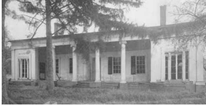
This was the Swift Mansion from the 1800s. Some have assumed its ruins were those of the orphanage.